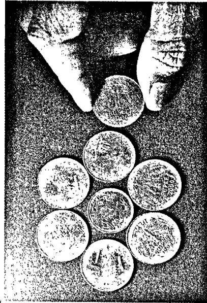
GIVE A COIN: Teaching students to give.

Responding to the reality that a large percentage of children in India are deprived even of basic necessities of life, let alone higher education, the upcoming festival will focus on improving the lives of the children by