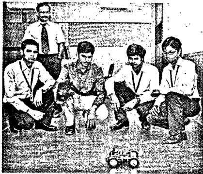
INNOVATORS: Team from Puducherry won first place at last Techfest.

According to the organisers, it is the continuation of their efforts to promote and establish sustainability that was undertaken in 2010-11 but at that time was limited to IIT Bombay only. With prize money worth Rs. 2.5 lakh, the challenge involves the Green Clubs of all colleges. It involves 99 tasks in all of various difficulty levels that have been divided into 11 genres that include energy, climate and air, sustainability, social outreach, bio-diversity and land management, food waste, social media, water, design and creatives.